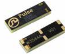
W3544A and W3544B